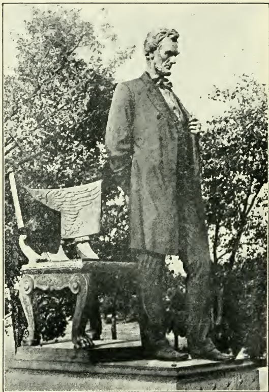
ST. GAUDENS' STATUE OF LINCOLN, IN LINCOLN PARK, CHICAGO.